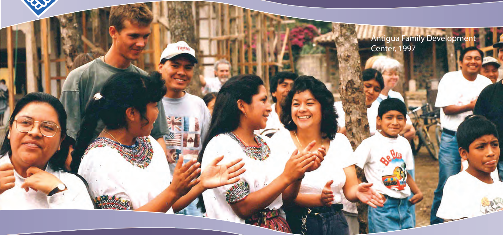
Antigua Family Development Center, 1997